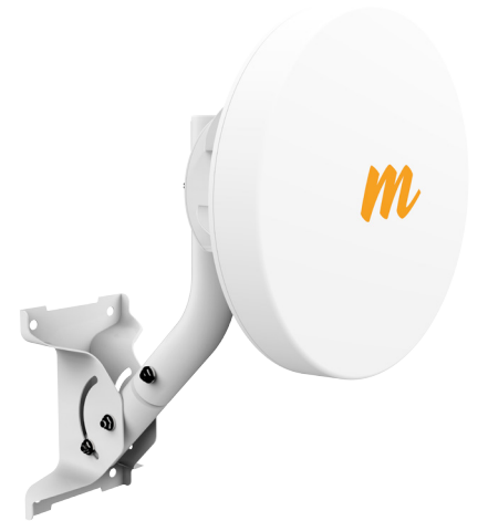
C5 with Mount